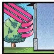
Summer Heat Out